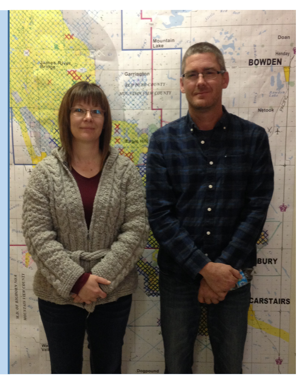
IMPACT Industry, Municipal, Public Action on Communication and Trust

Alberta Energy Regulator D71 regulations state that companies must conduct public consolation and/or notification within the Emergency Planning Zones around their facilities and pipelines. In the SPOG area where multiple company EPZ's overlap, SPOG has developed a unique and ongoing consultation program where SPOG staff visit the residents on behalf of participating companies. In 2015 SPOG managed the consultation and information of just over 5.000 records. This saves costs for the industry, decreases the disruption to residents, and improves public safety by having more data available in an emergency. SPOG will be starting 2016 visits soon.