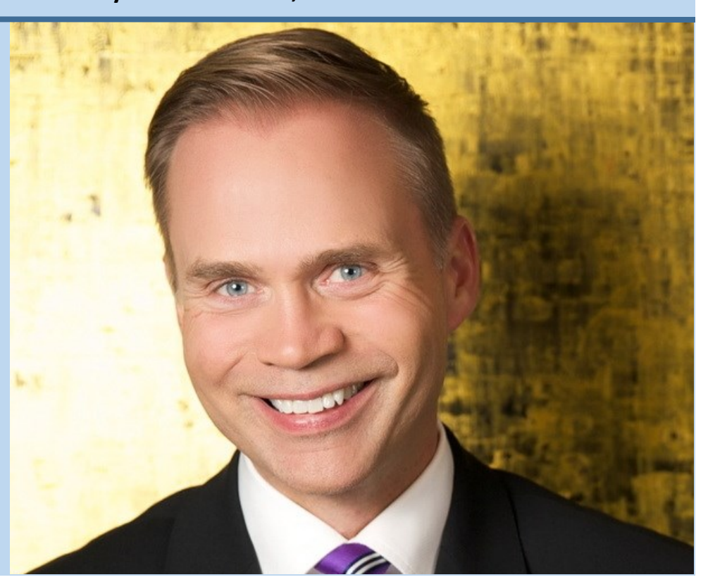
IMPACT Industry, Municipal, Public Action on Communication and Trust

Join him for a free pancake breakfast to kick off Neighbours' Day and peer into the crystal ball with him about the state of today's economy.